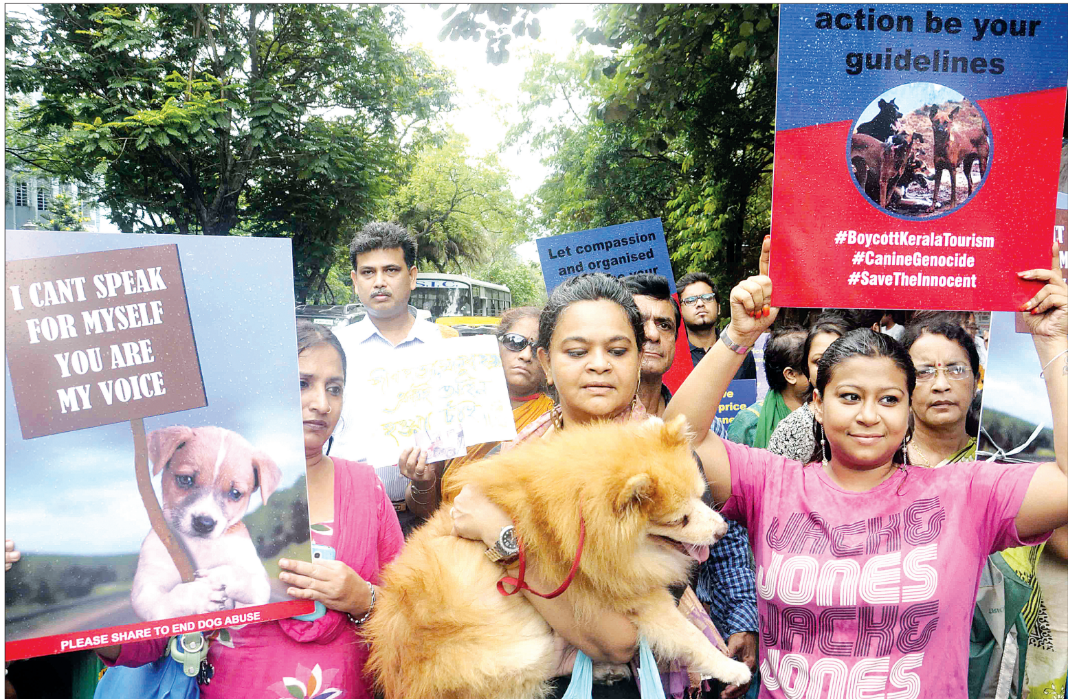
Dog lovers rally in Kolkata on Sunday to protest against the Kerala government's recent decision to kill all stray dogs

"Even when we went to Nabanna to meet the home secretary, we were denied an appointment. We will tell the EC that holding of a free election here will be impossible because the administration works in favour of Trinamool Congress," he said.