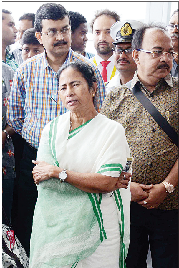
Mamata Banerjee at the Kolkata airport before taking her flight to London on Sunday

Heavy rains hit the city and different parts of West Bengal on Saturday, causing water-